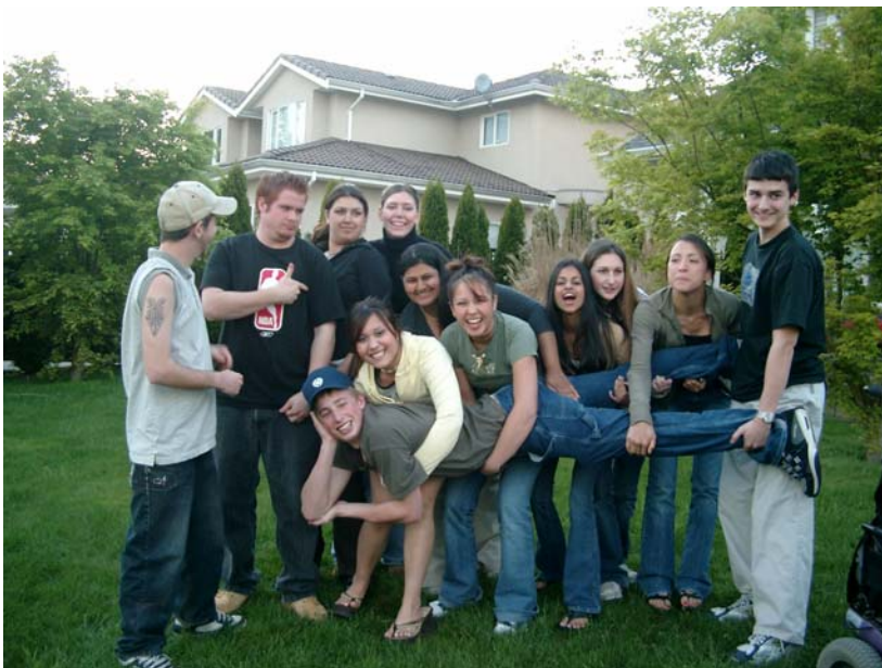
Photos (top right and bottom left): Deaf Youth Are Mentors Too! Program 2004

Our next group will be Fall 2004 and will run out of Abbotsford. If you are interested in becoming involved or know of a friend who may be interested please call us at 604.852.3331.